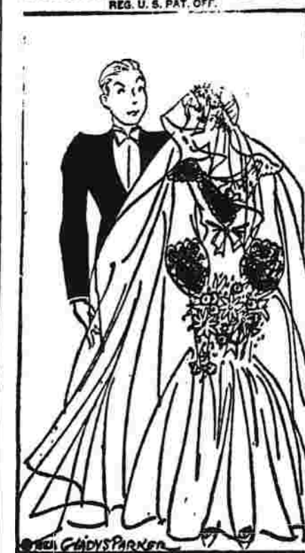
The boy who steals a kiss often gets a life sentence.